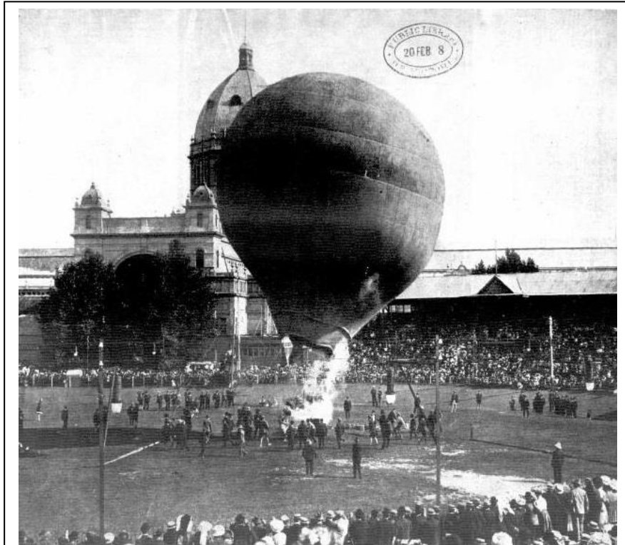
One of the balloons being filled with hot air in the arena next to the Royal Exhibition Building. Once filled, the balloon would be released and shoot upwards, with the balloonist on a trapeze beneath it. (Photo: State Library of Victoria).

When this event was staged on 19 February 1908, things did not go well. A crowd of about 15,000 people had gathered in the afternoon to see the ascent of the balloon named the 'President Roosevelt'. But owing to strong winds it proved impossible to