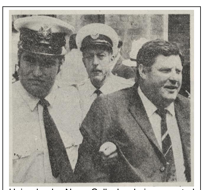
Union leader Norm Gallagher being escorted from the Carlton Courthouse by police after being sentenced to 14 days gaol for an incident that took place on the railway land in Park Street, North Carlton. ( The Age , 5 Feb 1971).

The post-World War Two period saw the rise of political activism. Young men could be arrested and fined for failing to register for national service, or to attend a medical examination. The practice of