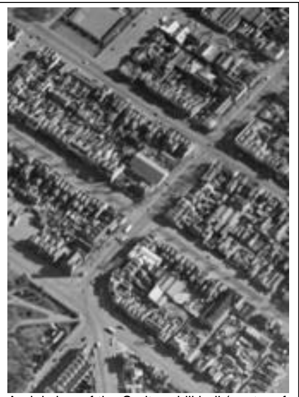
Aerial view of the Carlton drill hall (centre of picture) taken in the 1940s. Carlton Gardens are at bottom left. The street running from bottom left to upper right is Grattan Street.

(Source for this article: George Ward, Victoria's Land Forces 1853-1883 , self-published 1989)