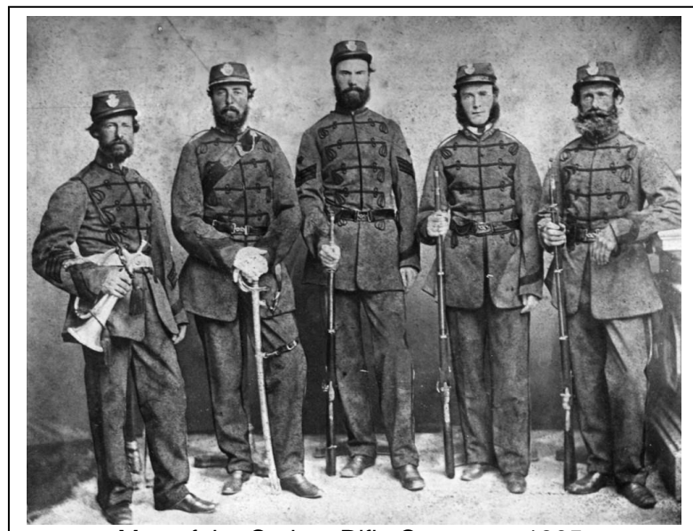
Men of the Carlton Rifle Company, 1865.

For the first 35 years of its existence, the Port Phillip District, later the Colony of Victoria, was defended by regiments of the British Army. But these were gradually reduced and in August 1870 the last of the British regiments left the colony. The defence of the vulnerable gold-rich colony was then the sole