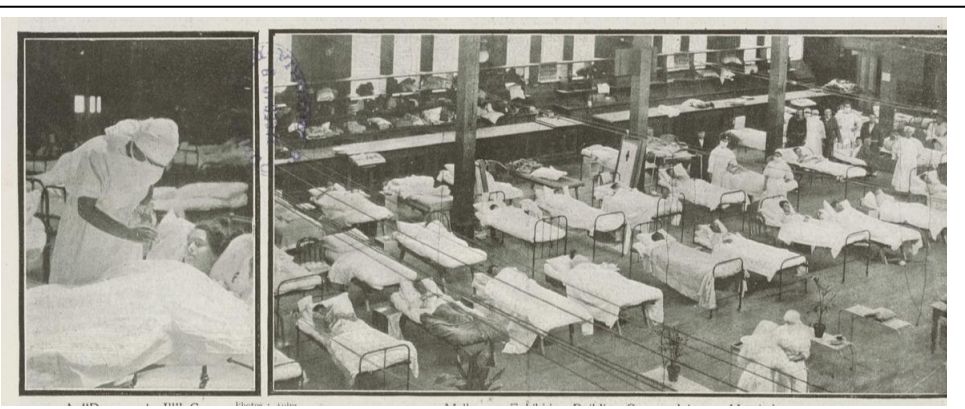
The Royal Exhibition Building converted to an emergency hospital during the Spanish Flu pandemic in 1919. (Photo: Sydney Mail , 19 Feb 1919).

Pneumonic influenza, sometimes referred to as Spanish flu, spread around the world in 1918 with troopships returning soldiers to their homes. From October. early Australia instigated a range of measures. including quarantining all ships with any sign of influenza. From early January 1919