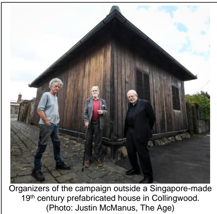
Organizers of the campaign outside a Singapore-made 19 th century prefabricated house in Collingwood.