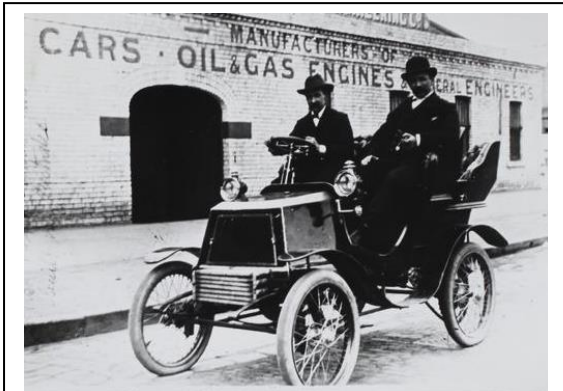
A Tarrant motor car outside the company's garage in South Melbourne.

petrol-driven car in 1901, and was instrumental in establishing the local car manufacturing industry. The company, based in the city, expanded its manufacturing capability in 1909 by building the Melbourne Body Works factory at 61-75 Lygon street, Carlton. This was followed by a repair shop in 1911, on the corner of Lygon and Queensberry streets. The business suffered a setback in October 1919, when a fire caused an estimated £5,000 damage to the building and contents. In addition to damage to motor cars and parts, company records and valuable plans for aeroplane construction were lost. Phoenix Motors took over the premises in the early 1920s and moved to St Kilda in 1931. Davies Coop & Company Limited acquired the corner site, together with much of the surrounding area, in 1937. This was eventually redeveloped as part of RMIT University.