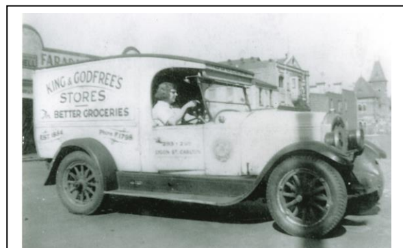
Behind this King and Godfree's delivery van in Faraday Street the top of the Faraday Motors building can just be seen.