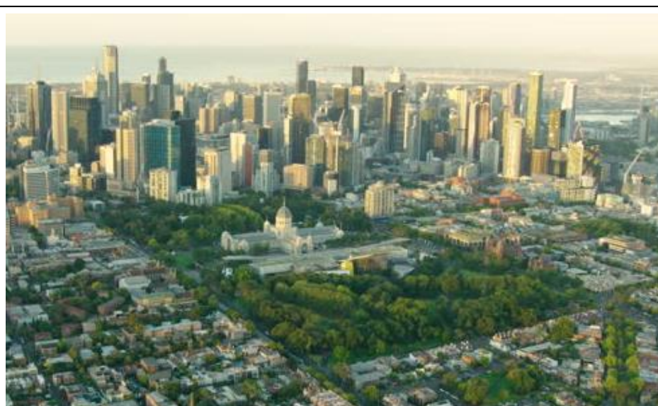
An aerial view of the Royal Exhibition Building (centre) and surrounding Carlton Gardens showing the closeness of high-rise building to this World Heritage site.

In last June's 'History News', I wrote about the threats to the Royal Exhibition Building and Carlton Gardens World Heritage Site. Australia promised to create a buffer zone around the Carlton Gardens, the World Heritage Environs Area (WHEA), to maintain the heritage character surrounding the site. But the Victorian Government removed protection from much of the WHEA in 2009. The result was a forest of towers, topped by the 65-storey twin tower Shangri-La Hotel under construction near Victoria Street.