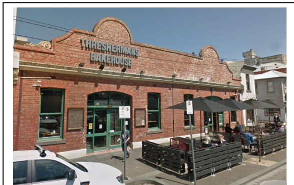
The former Federal Garage and Faraday Motors building in Faraday Street.

The most recent occupant was Thresherman's Bakehouse, which vacated several years ago, and the old brick building is currently being refurbished for a new tenant.